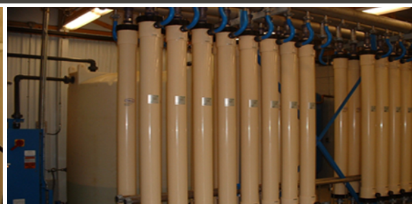
Blue Spring Water Treatment Plant Membrane Filtration Technology